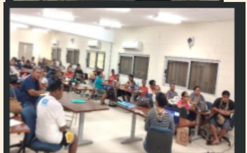
Preventing Childhood Obesity: A workshop for Early Childhood Education.