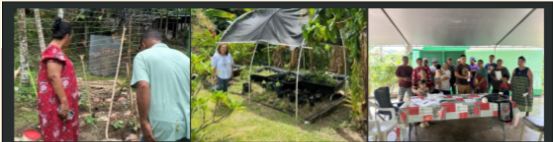
Chuuk households engaging in crop production and training.