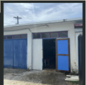
The COM-FSM & Yap State R&D shared hatchery.

The College of Micronesia-FSM (COM-FSM) and Yap State R&D have renewed their Memorandum of Understanding (MOU) for another 10 years, from August 1, 2024, to July 31, 2034. This partnership aims to collaborate on research and development projects to improve aquaculture practices in Yap, focusing on developing new techniques for raising valuable fish and other marine species and promoting sustainable aquaculture practices. The collaboration has a successful history, particularly in sea cucumber technology, resulting in the development of hatchery and grow-out technology for a high-income valued species of sea cucumber.