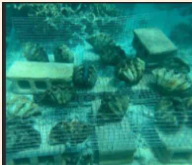
Palauan giant clams in a community farm.

The program aims to raise awareness and provide technical training for sustainable aquaculture practices. In Yap, the program reached 245 participants, equipping them with the knowledge and skills necessary for sustainable aquaculture practices, including giant clam nursery establishment, transplantation, monitoring, and maintenance. The program also hired a new Aquaculture Extension Agent II to provide ongoing support and expanded to Chuuk CRE. In Chuuk, the program engaged 350 clients through 20 outreach events, covering giant clam and rabbitfish hatchery techniques. 36% of participants increased their knowledge and 29% adopted skills in these areas. Both programs successfully educated community members and motivated them to engage actively in sustainable aquaculture practices, laying the groundwork for future initiatives aimed at enhancing food security and economic resilience within Yap and Chuuk States. The program also imported two giant clam species from Palau to facilitate continued aquaculture work. This action helped to diversify the genetic stock of giant clams in Yap and ensure the long-term sustainability of the aquaculture program.