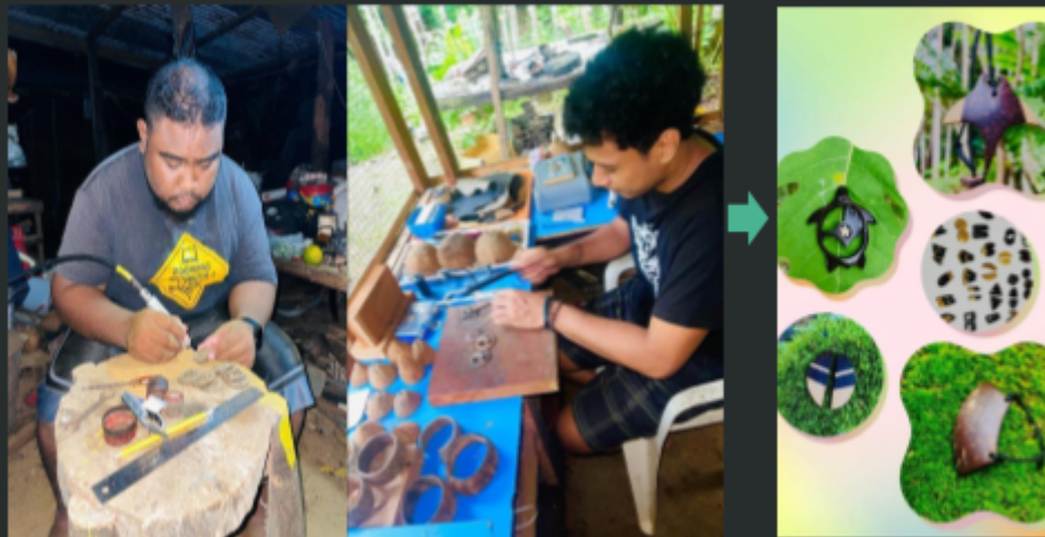
Yap youth turning their passion for local craft-making into profitable ventures.

The Youth and Family Issues programs in Yap, Chuuk, and Pohnpei have all made significant progress in supporting young people and families in Micronesia. In Yap, the program reached 175 participants, empowering them with essential life skills and enabling some to turn their passion for craft-making into profitable ventures, while others established thriving home vegetable gardens. In Chuuk, 628 individuals participated in sessions focusing on substance abuse, moral values, family relationships, and physical education, leading to increased knowledge and positive behaviors among participants. In Pohnpei, sessions were held for 311 clients, with successful youth groups engaging in agricultural activities (generating income) and recreational sports, contributing to their self-sufficiency and overall well-being. Despite challenges such as transportation issues and community events, the programs have made a positive impact and have plans to disseminate project results and continue outreach activities. The impact extended beyond the participants, benefiting the broader community through healthier youths and families.