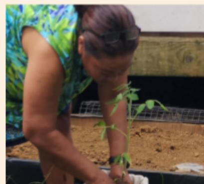
Client adopting recommended practice (right) and utilizing recycled materials for a planter (left).