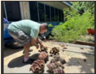
Giant clam hatchery training for Chuuk CRE Aquaculture Agent.

COOPERATIVE RESEARCH AND EXTENSION ACCESS INNOVATION RESILIENCE