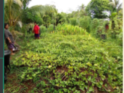
A household sweet potato cultivation