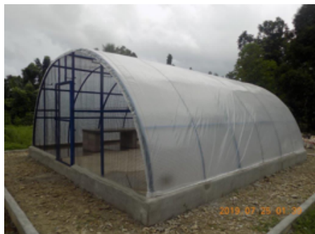
Photo: Greenhouse at Pohnpei CRE to support extension and outreach activities