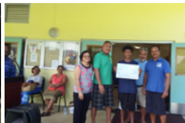
Photo: First place winner of the Yap Campus Summer Science Fair on student project title "How many giant clams can we hatch over three months?" Prize presented by Yap Campus Dean and representatives of the Yap State Legislatures

Kosrae Campus ..... continued from page 10