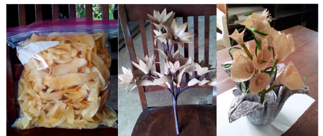
Photo: Homemade products for the local market in Kosrae