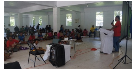
Photo: CRE agent presented on climate change adaption strategies

Extension agents were invited by the Behavioral Health and Wellness program to join in a chartered trip to the Mortlock Islands. Technical assistance, information sharing and public awareness, and hands-on trainings were conducted on various topics including climate change, agroforestry and gardening, food safety, and nutrition. Over 170 youths, women, and men participated the extension activities.