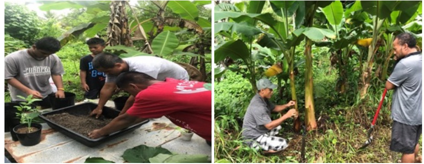
Photo: Youths (left) and individual farmer trained in planting techniques

Technical assistance was provided to individuals in their applications seeking funding assistance for food security projects. Hands-on demonstrations were conducted for youths and individual farmers in sustainable agriculture practices.