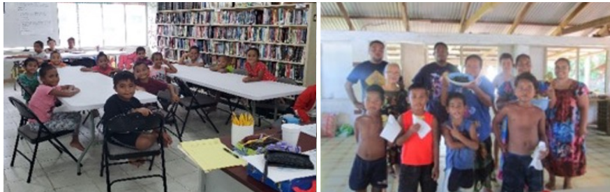
Photo: Children in Yap (left) and Chuuk (right) participating in school intervention programs

School intervention programs in Chuuk and Yap focus on promoting children’s well-being through active programs and providing information about nutrition, health, physical education, and appropriate indigenous knowledge and practices. Childhood obesity continues to be a significant health problem across the Micronesian region.