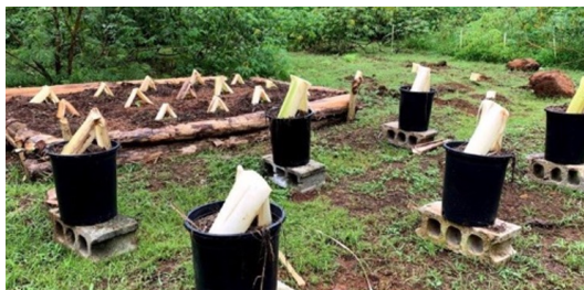
Photo: Newly established demonstration plot at Pohnpei State Division of Agriculture

Extension staff was trained in soil management strategies, compost preparation, urban vegetable growing methods, construction of various types of growers, and nutrient management. As part of the training, extension staff selected a 20x 20’ garden plot at the Pohnpei State Division of Agriculture premises for establishing a demonstration garden. So far, they have planted okra and eggplant in