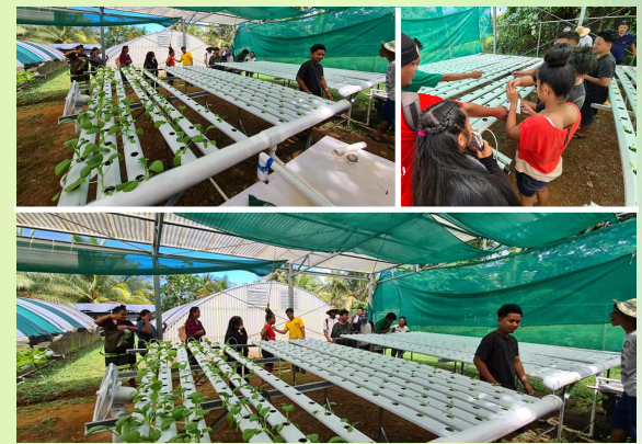
Students from the Agriculture Program apply their crop reproduction learning outcomes at the hydroponic farms.