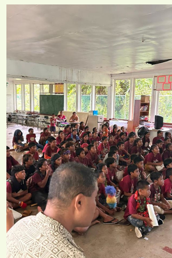
Increasing knowledge of climate-change impacts among the youth population (Chuuk CRE)