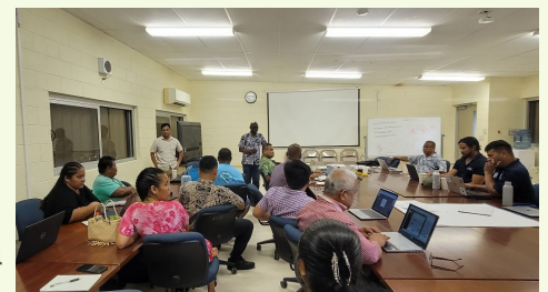
Meeting in Yap of CRE Teams from the three partner colleges under COM Land Grant

All seven annual reports were successfully submitted by uploading to the online USDA National Reporting System (NRS) by February 23, 2024 for review and final transmittal to USDA NIFA review. The team also conducted reviewed of each colleges' extension and research programs under COM Land Grant and shared their results and feedback from stakeholders and partners. These initial discussions and planning will be used to determine any changes in next year's Plan of Work, due June 1st, 2024 to USDA NIFA. The visit to Yap also provided opportunities for closer collaboration with Land Grant partner colleges. Starting next FY, CMI and PCC will join the CRE's Childhood Obesity Program for a regional approach in addressing this critical issue in the islands.