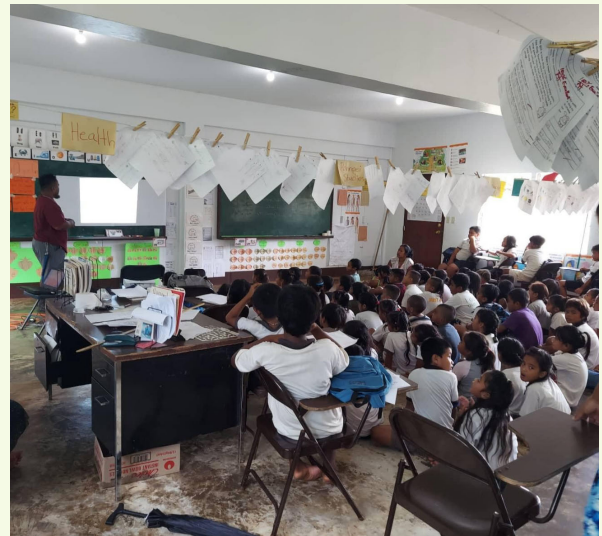
A presentation on food safety practices and water quality measures.