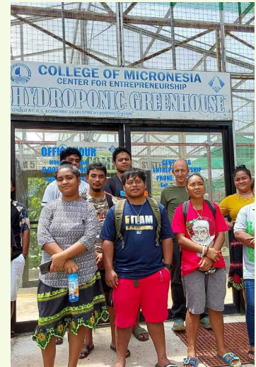
Student visitors to the Hydroponics Greenhouse at the National Campus

Enriched Learning Opportunities for Students: Through initiatives such as apprenticeships, internships, and experiential learning opportunities, our students will have access to a broader range of hands-on experiences that align with the college's mission of capacity-building and community development.