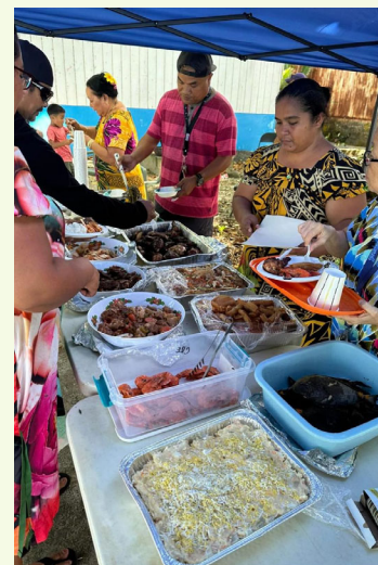
Cooking demonstration and display of recipes in Chuuk

The importance of food and nutrition education in our communities was found in a recent survey in 2021 Western Regional Agricultural Stress Assistance Program (WRASAP), where it was the topic of highest interest, above financial, by respondents. CRE EFNEP aims to ensure a wider audience is reached to support communities' interests and needs.