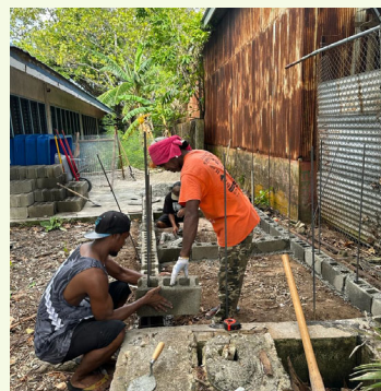
Chuuk CRE begins work to install their aquaculture demonstration on campus