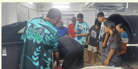
Marine science students visits the COM Land Grant Aquaculture Hatchery Facility at Nett Point, Pohnpei