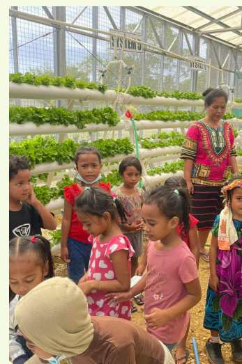
Children from Early Childhood Education Center visits hydroponics greenhouse facility in Yap

Farmers from the four states are being identified for CFE to assist in farm management and business development.