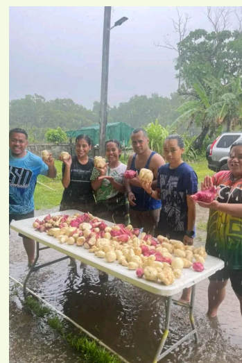
70 lbs of sweet potato harvested by the Utwe Youth Club in Kosrae