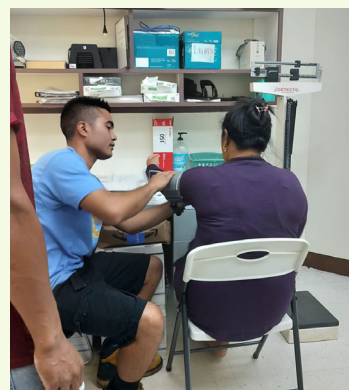
Extension Agent taking measurements