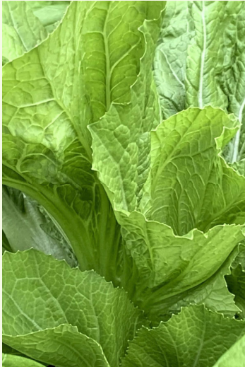
Mustard Cabbage var. Kai Choy ‘Hirayama’, an open-pollinated variety

This research project was closed out in February 2023, however, the success of the initial phase of this project sets the stage for a second phase, aiming to incorporate more open-pollinated vegetable varieties suitable for the island environment. This expansion aligns with the project’s overarching goal of enhancing crop diversity and resilience. The project has made strides to a certain extent in supporting the seed systems in the island environment. As the project moves into its next phase, the foundation laid in this initial phase promises continued success and positive outcomes for the local community.