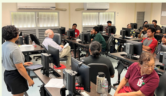
AFT students, Agriculture Instructors, and CRE Extension staff meet UOG visiting team at Yap campus

As a result of the meetings and discussions on program alignment, a list of promising courses have identified for further review to prepare for the next meeting in Guam in July, 2024.