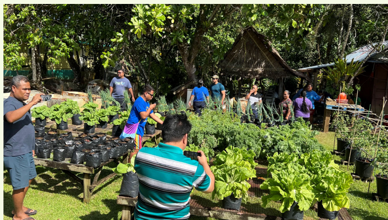
Showcasing container gardening to COM Land Grant management team as a successful strategy in climate-smart adaptation to ensure food security for households