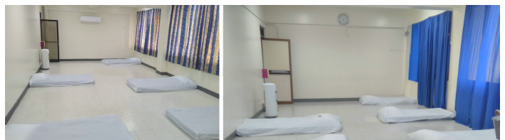
Table tennis and pool rooms in the FSM-China Friendship Sports Center temporarily converted to isolation rooms.