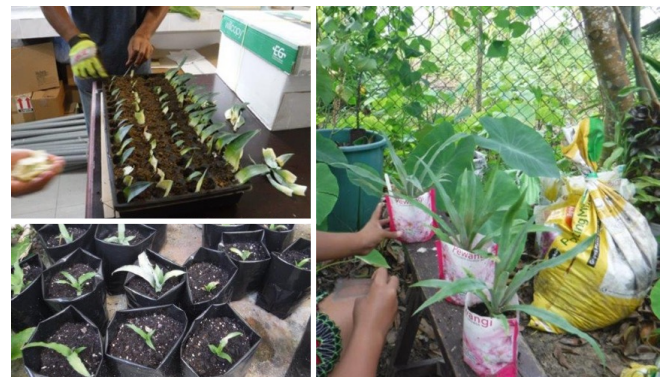
Pineapple crown leaves as an excellent source of planting materials.

Chuuk CRE has been testing the use of pineapple crown leaflets to increase production of planting materials. The lack of quality and healthy planting materials is a major constraint in agriculture development and food security programs in the FSM. The crown of the pineapple contains 50-70 leaves that can be utilized for rapid multiplication of planting materials for interested farmers and communities.