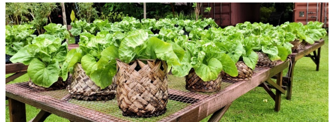
Coconut leaf woven basket is an eco-friendly, cheap, and sustainable replacement for plastic containers in gardening.

Starting vegetable production at household level is a quick solution to have access to fresh agricultural produce during challenging times. In addition to the traditional homestead vegetable gardening, other innovative methods will be tested and disseminated to motivate rural folks to increase access to agricultural products and nutritious food.