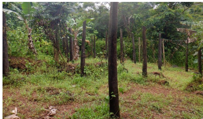
Newly planted black pepper farm.

Pohnpei CRE has increased their efforts to engage farmers and families in Pohnpei to produce and increase production of black pepper. As a cash crop, black pepper has been considered a relatively rare commodity of exceptionally high quality that was marketed successfully in the past. However, production has been limited and commercial potential has not been fully exploited. Extension agents continues to provide support and technical assistance to farmers to try and revive this industry. Eight new farms were established recently with 50-100 posts per farm.