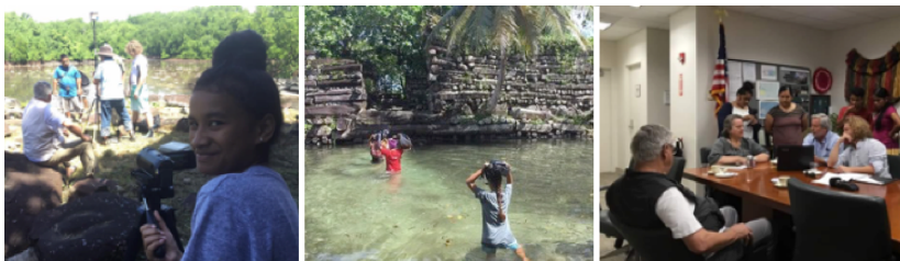
Filming CSRM Foundation on location

The next phase of the project is to edit the documentary with a final production date in about eight months. The US Embassy is also in contact with National Geographic who is preparing a series for the National Geographic channel that includes a segment on Nan Madol. We are hoping to have the student’s documentary included as part of this segment.