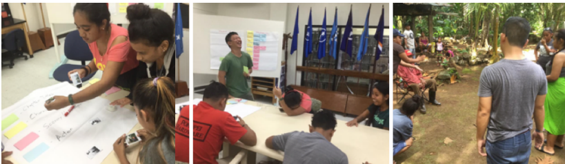
Preparing the Storyboard

Several students from COM-FSM are working on a documentary of this project. This opportunity grew from a cross-disciplinary course over the summer in both English and Micronesian History that drew the attention of the US Embassy in Kolonia. The students from the class were awarded a $40,000 grant to buy filming and editing equipment, and to hire professional help for a documentary about CSRM’S project.