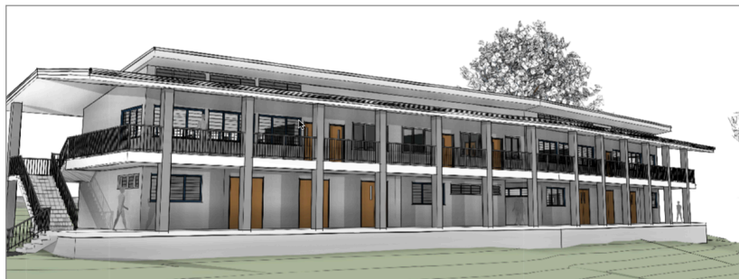
Artist’s rendition of the proposed CTEC Multi-Purpose Technical Building. By Beca International Consultants, Ltd.

Former UB/ETSP Building was demolished last December to make way for the new CTE multi-purpose technical building. Ground breaking is anticipated to occur in April 2019 with completion of the project by fall 2020.