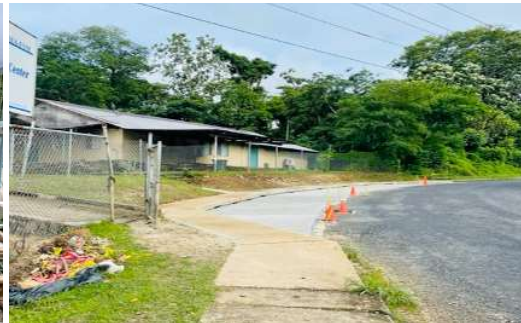
The bus/taxi drop-off by the entrance to the lower part of CTEC is complete. This drop-off will assist mitigate traffic issues at the lower CTEC parking. The location of the drop-off is ideal since it is directly in front of the student resting area for the lower CTEC.