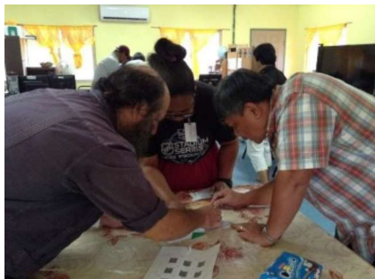
Group team-building activity

This day brought faculty and staff together to get hands-on training on TracDat and Canvas along with team-building activities. All faculty and staff gathered at the student lounge to share information about campus programs, services, and had fun activities. One of the highlights for the day included a presentation on Spawning Giant Clams by CFE Aquaculture Extension Agent Vivienella. Faculty and staff were teamed up in groups to identify areas needing improvement as well as share success stories or work accomplishments they are proud of.