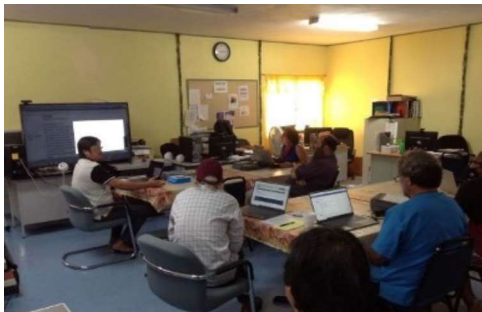
Faculty sharing how to's & better use of canvas