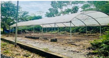
The green house for AFT is being assembled between the upper and lower part of CTEC. The green house is next to the path under the mahogany trees. This green house will be a venue for providing the practical aspect of the AFT courses.