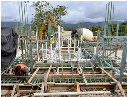
Foundation work of the multi-purpose building continues which now includes some plumbing installation. Progress is slower than expected due to rainy weather, but there is progress nonetheless.