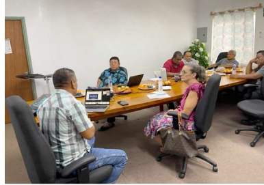
Registered Apprenticeship Training Program's May 25, 2022, meeting.