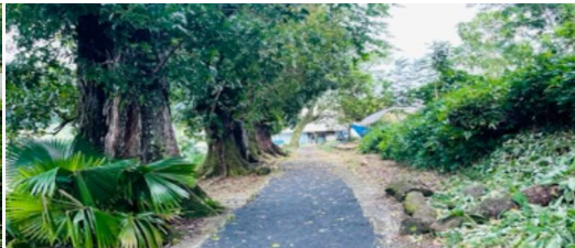
The Maintenance laid black sand on the pathway between upper and lower CTEC and this work continues. In addition to beautifying the pathway, this initiative also improves the walking surface of the pathway.